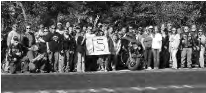
Local 15 Trash n Treasurer